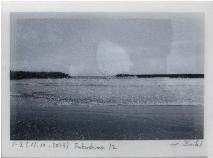
1 – 2 (11.10.2023) Fukushima 12

quartz powder, beeswax, resin, pigment print on Japanese paper, aluminum plate, wooden panel