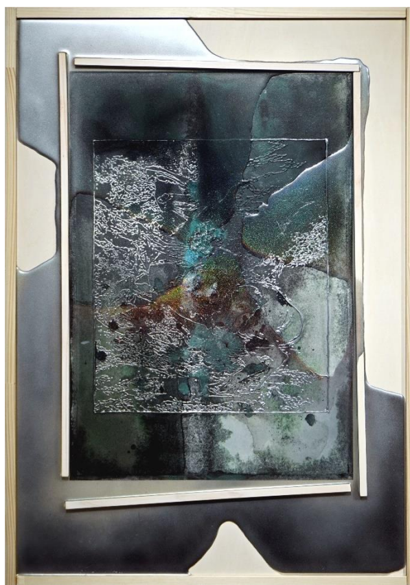
Crossing the ALPS Third time

The “Crossing the ALPS” series references “Napoleon Crossing the Alps”, painted for propaganda purposes by Jacques-Louis David (1748-1825), who used seawater to diffuse pigments and water-soluble paints on the artwork throughout. The paints are affected by the distortion of the washi paper. The paint diffuses onto the work in a way that is affected by the distortion of the washi paper, and the entire washi paper, which serves as the support, is stained with a color reminiscent of the deep sea. The simple wooden weir surrounding the figure in the center of the painting collapses under the pressure of the poured resin, and the resin overflowing from it shakes the notion of inside and outside the painting, but is barely contained by a second weir surrounding the entire work. However, the height of the second weir is much lower than the first weir.