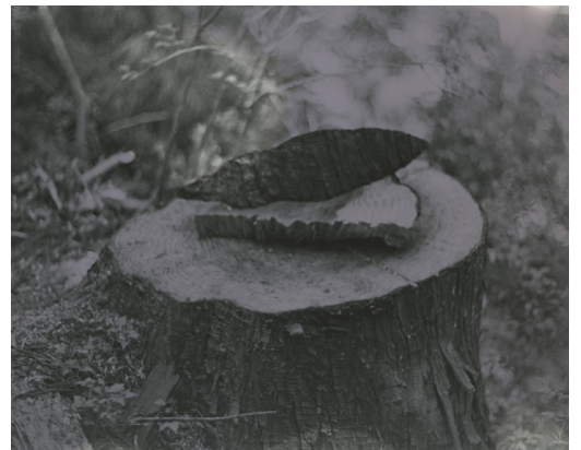
WIP Image for Silent Echoes of the Cedar | 2025 | 192 mm × 240 mm Salt fixed gelatin silver print with cedar-based developer