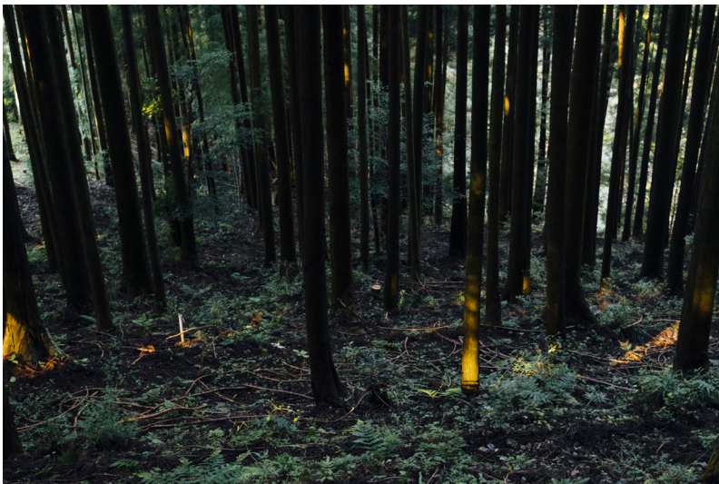
WIP Image for Silent Echoes of the Cedar | 2025

This body of work as an installation suggests the danger of uniformly addressing issues related to human intervention in nature, unintended consequences, and socially complex problems that inherently contain multiple meanings. In an era where environmental issues, ethics, and moral values are increasingly globalized, this exhibition offers an opportunity for us to reconsider and localize the facts confronting us. We invite you to visit and reflect on this thought-provoking exhibition.