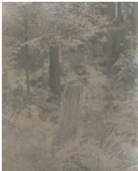
WIP Image for Silent Echoes of the Cedar 2025 | 240 mm × 192 mm Salt fixed gelatin silver print with cedar-based developer