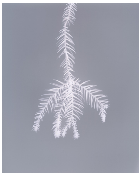
WIP Image for Silent Echoes of the Cedar 2025 | Lumen print reworked digital